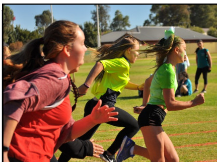
Sports Day 2018