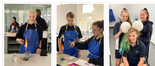
Year 9 Students Heating Samples and Investigating Static Electricity

The Year 9 classes have started their year studying the Chemical Sciences Strand of the Australian Curriculum. This has involved them learning about atoms and their electrons, by heating samples in Bunsen Burners, and investigating Static Electricity. All Year 9 students are researching an element from the Periodic Table and creating a poster which will be used to create a student Periodic Table in the Science Area.