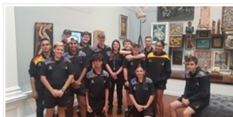
Students at the Art Gallery of South Australia