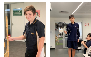
Year 8 Students Designing Parachutes

Our Year 8 students have settled in well and are starting to develop their laboratory skills. After their initial focus on safety, the Year 8 classes are now learning how to design their own experiments, record results and analyse data. This is leading them to their first summative practical where they design, build and test a Parachute. Look out for photos of the testing in the next newsletter.