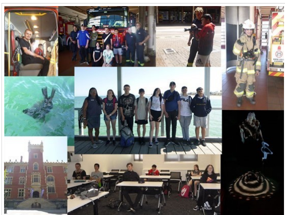
Year 10 Students on the City-Based Discovery Program