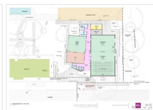
Artist Impression of Future Performing Arts Centre