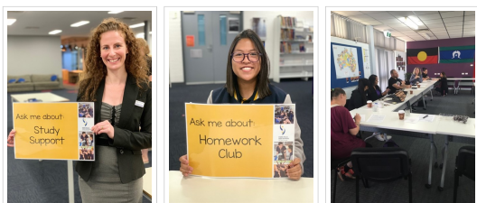
Year 8 Acquaintance Evening and Morning